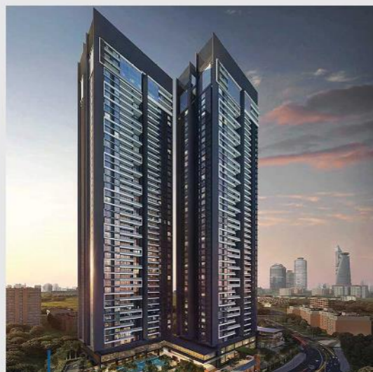
The Estate @ South Bangsar