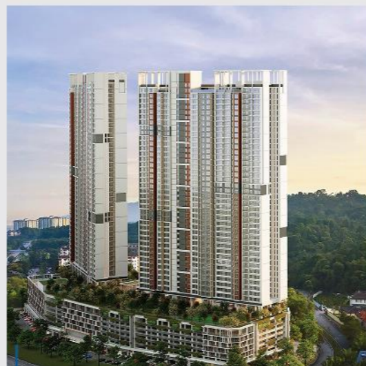
Sunway D'hill Residences @ Kota Damansara