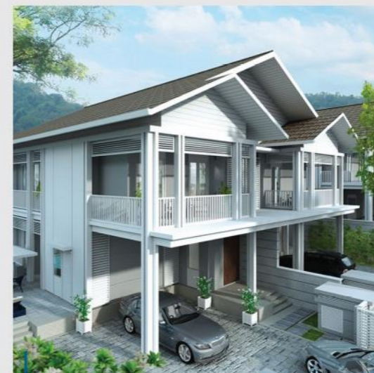
Serene Mont Kiara @ Mont Kiara