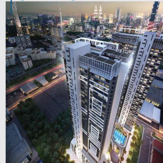
Trion 2 @ Jalan Sungai Besi