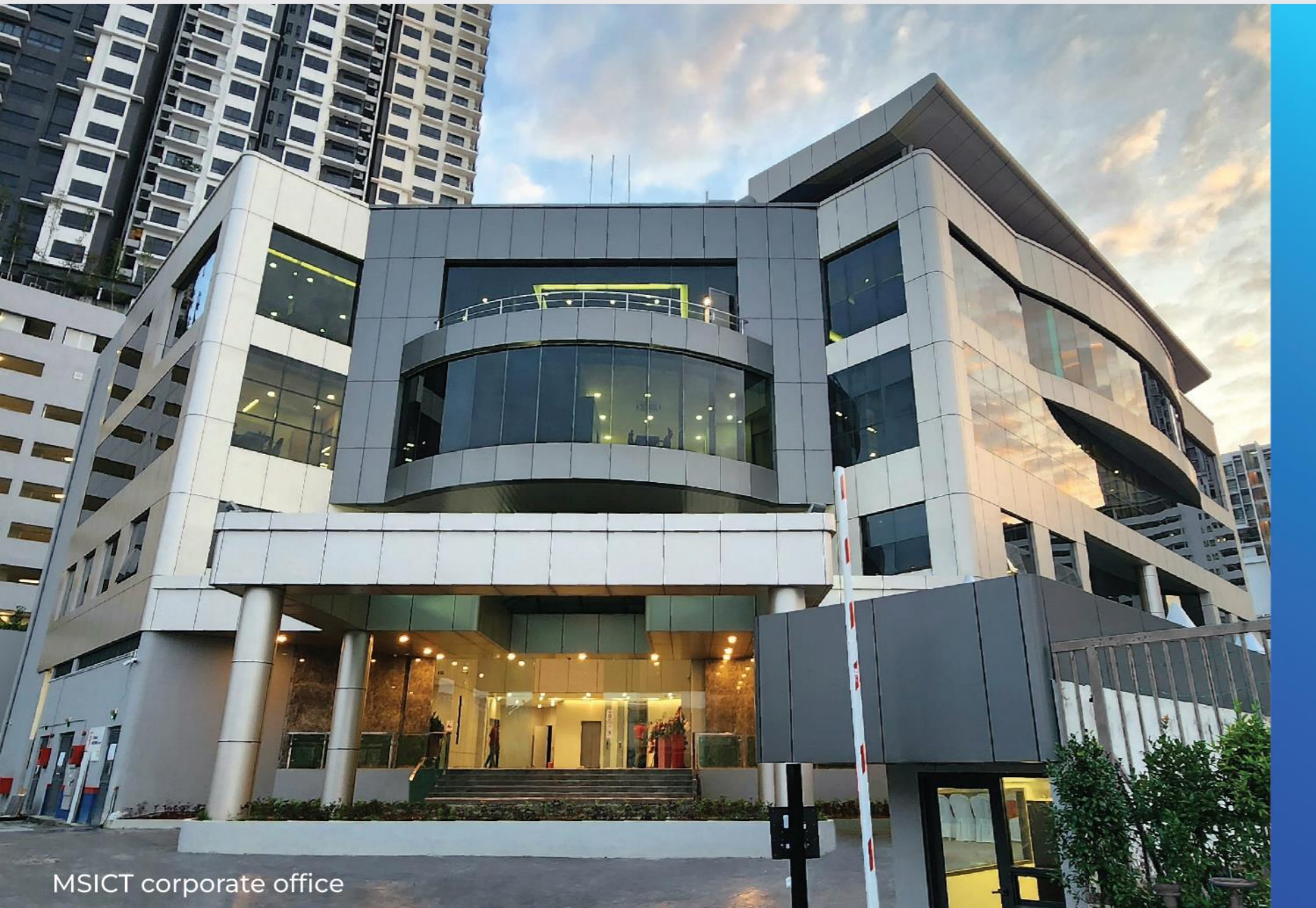
MSICT corporate office