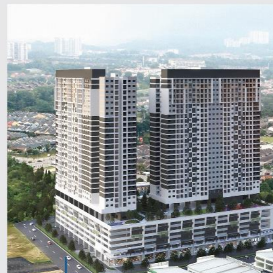
Traders Garden @ Cheras Selatan