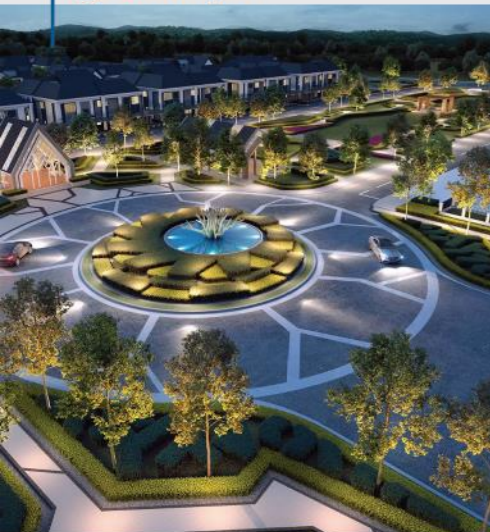
Eco Forest @ Semenyih