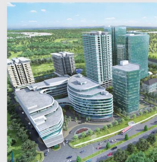
Edusphere @ Cyberjaya