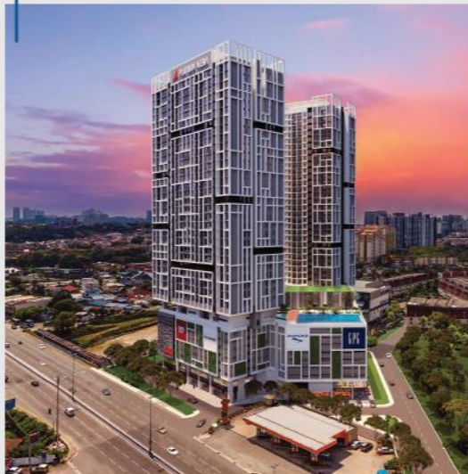
Platinum Arena @ Old Klang Road