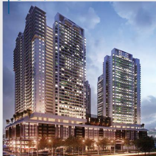
KL Traders Square @ Setapak